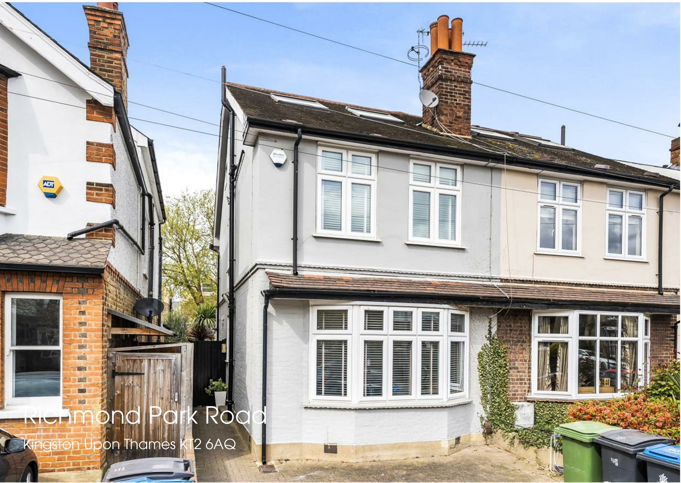
Richmond Park Road Kingston Upon Thames KT2 6AQ

34 Richmond Road Kingston upon Thames Surrey KT2 5ED www.gibsonlane.co.uk Tel: 020 8546 5444